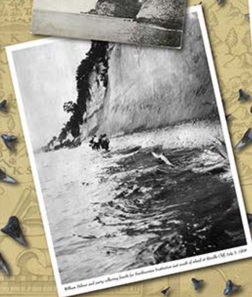
William Fisher and party collecting fossils for Smithsonian Institution just north of cliffs at Chesapeake Beach, July 3, 1908