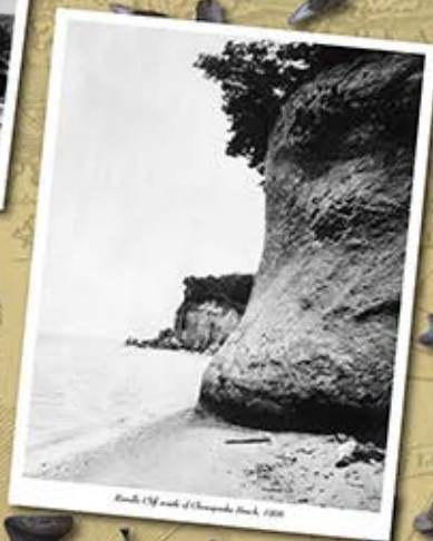
Cliffs of Chesapeake Beach, 1908