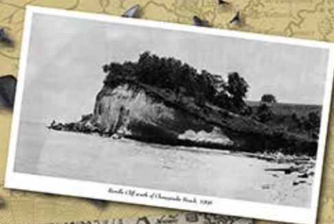
Cliffs of Chesapeake Beach, 1907